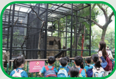
• 外出考察活動：香港動植物公園。