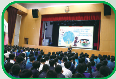
• 校園齊惜福環保講座。