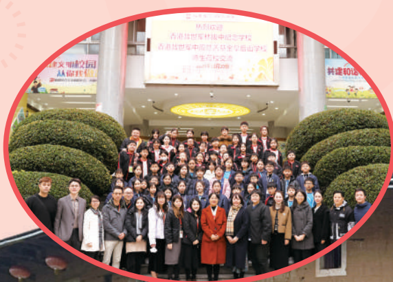
• 與廈門實驗小學締結為姊妹學校，師生前往當地進行交流。