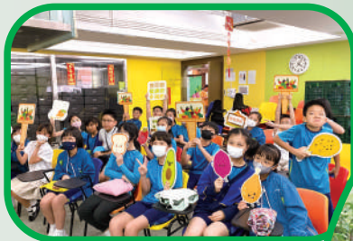
• 參觀齊惜福油塘社區廚房。