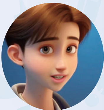
• AI虛擬主播 —— 夢想。