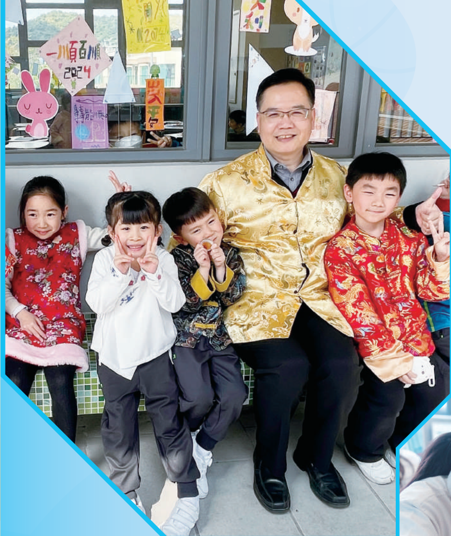
• 承傳中華文化—華服日。

致力提供優質的全人教育，透過多元化的教學活動及策略，提升學生的共通能力、並養成自主學習的習慣。培育學生成為一個「愛生命、好學習、護環境、澤社區」的皇后山人。