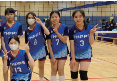
THP Girls Volleyball Team— First Runner-up in Hong Kong Schools Sports Competition THP 女子排球球隊 —— 學界亞軍