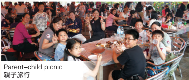
Parent-child picnic 親子旅行

在本院的支持下，我們定期舉辦親職教育課程，如：講座、工作坊等，讓家長了解學生的校園生活和親職教育的資訊。我們期望家長信任及支持學校，共同培育學生良好的品德和價值觀，在珍貴的小學階段攜手同行。