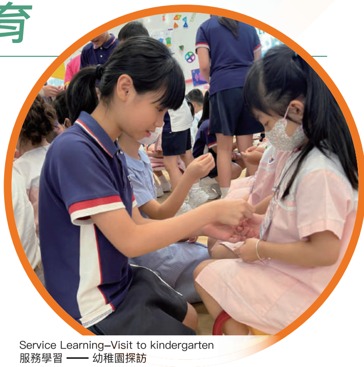
Service Learning—Visit to kindergarten 服務學習——幼稚園探訪