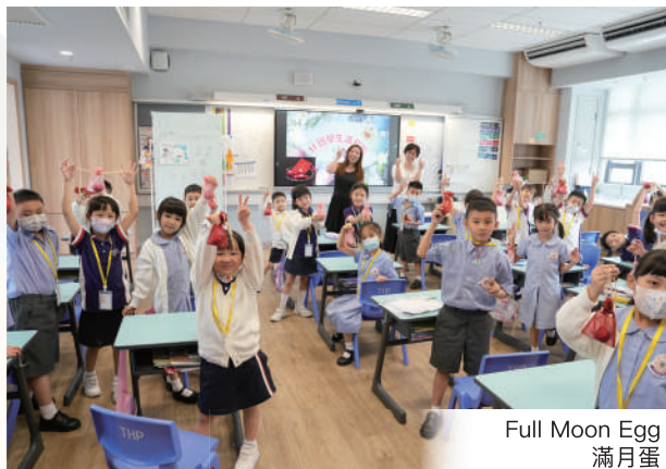
Full Moon Egg 滿月蛋

To cultivate students' virtues with positive values, we strive to promote the TWGHs Moral Education Curriculum and Positive Education in the school. In addition, the school will provide students with a wide range of service-learning activities, such as "Tung Wah Cultural Inheritor programme", "Soccer Ambassador" programme, etc., which provide an opportunity for students to contribute to the society.