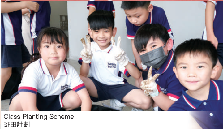
Class Planting Scheme 班田計劃