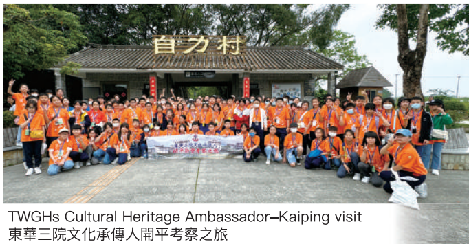
TWGHs Cultural Heritage Ambassador-Kaiping visit 東華三院文化承傳人開平考察之旅