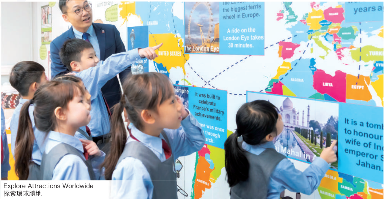
Explore Attractions Worldwide 探索環球勝地