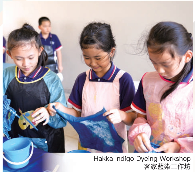
Hakka Indigo Dyeing Workshop 客家藍染工作坊

我們透過體驗式遊歷課程，鼓勵學生親自規劃行程、主動探索和學習遊學活動目的地的知識，讓他們能夠從遊歷中觀察、體驗和學習新知識和技能。此外，透過境外學習交流活動，孩子們能夠與世界各地的學生互相交流和了解，體驗不同風俗文化和生活，從而放眼世界，擴闊視野。