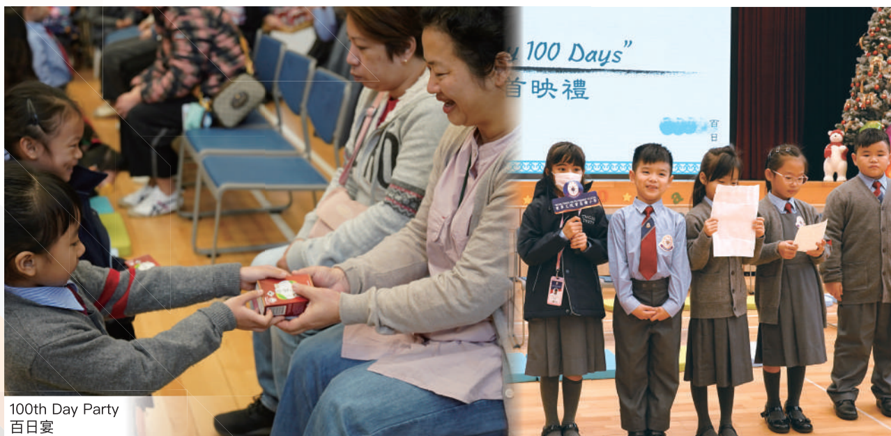
100th Day Party 百日宴

我們積極推動院本德育課程及正向教育，培養學生良好品德及正確價值觀，並透過「東華文化承傳人」計劃、「有品足球大使」及多項服務學習活動，為學生提供「回饋社會」的實踐機會。