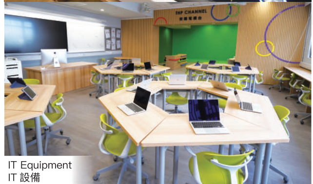
IT Equipment IT 設備