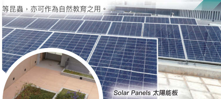
Solar Panels 太陽能板

位於三樓的多感官花園種植不同類型的香草，以吸引蝴蝶等昆蟲，亦可作為自然教育之用。