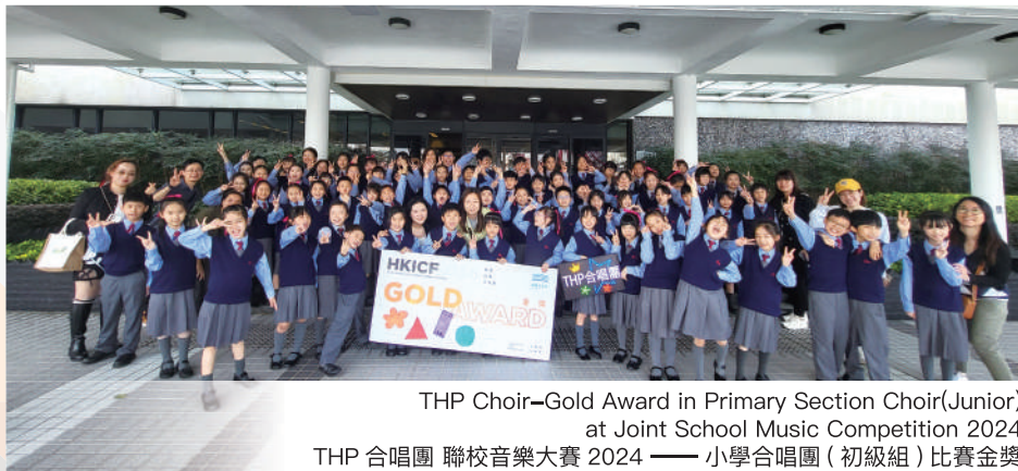
THP Choir—Gold Award in Primary Section Choir(Junior) at Joint School Music Competition 2024 THP 合唱團 聯校音樂大賽 2024 —— 小學合唱團(初級組)比賽金獎

我們重視學生的全面發展、身心健康及多元智能的培養，除正規課程外，我們會以「專家入課」的形式為學生提供多元化的學習經歷，並在課後提供各類體藝及音樂興趣班等課外或專業培訓活動，以促進他們多元智能的發展，讓他們能展現自我，發揮潛能，盡展所長。