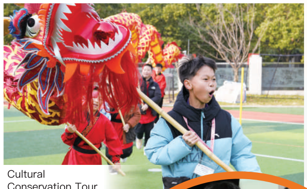
Cultural Conservation Tour in Chengdu 成都文化保育之旅