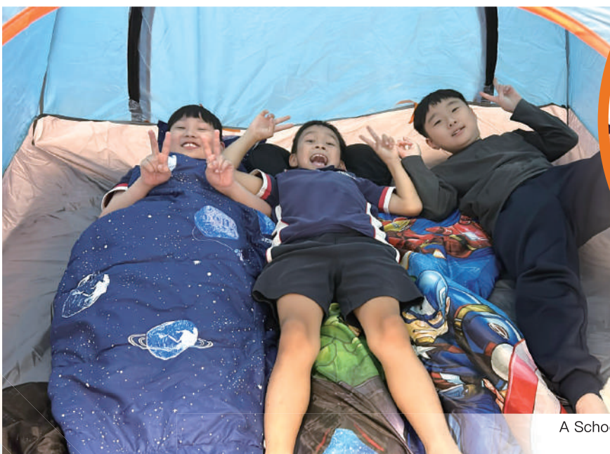
A School Sleepover 學校宿一宵