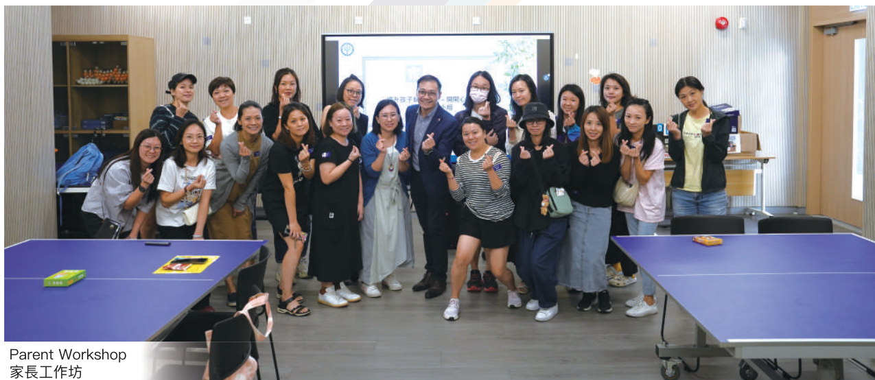
Parent Workshop 家長工作坊