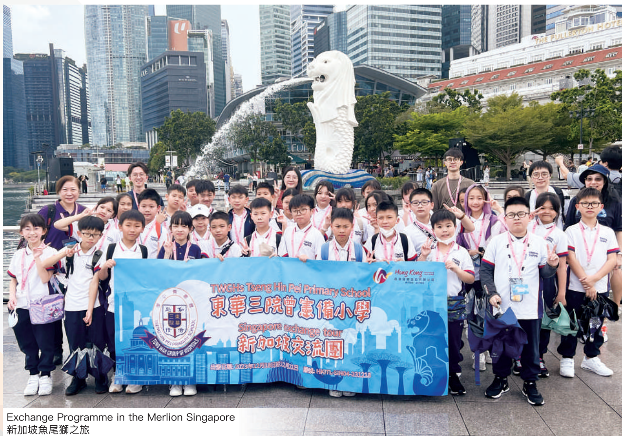
Exchange Programme in the Merlion Singapore 新加坡魚尾獅之旅