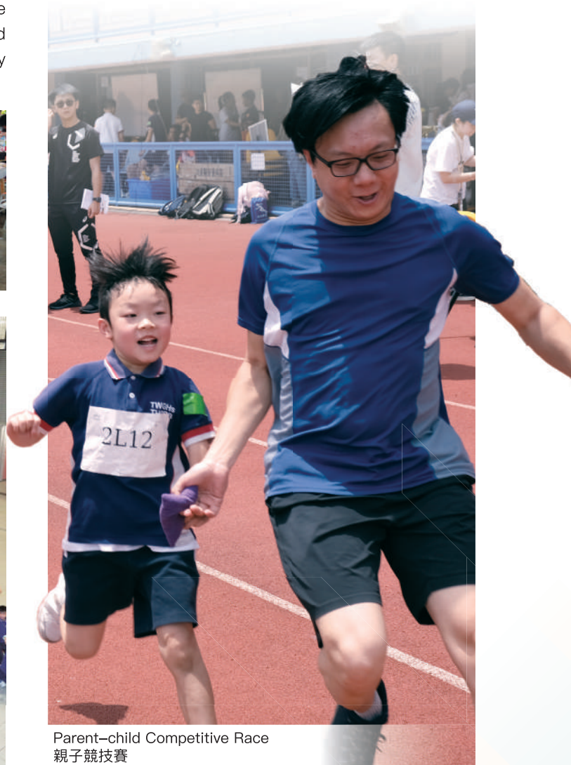
Parent-child Competitive Race 親子競技賽