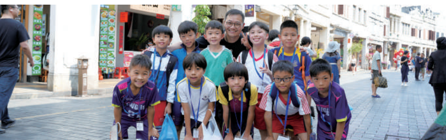
TWGHs Joint Primary School Soccer Ambassador-Exchange Programme in Haikou city, Hainan Province 聯校有品足球大使到海南省海口市交流