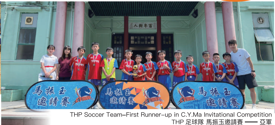
THP Soccer Team—First Runner-up in C.Y.Ma Invitational Competition THP 足球隊 馬振玉邀請賽 —— 亞軍