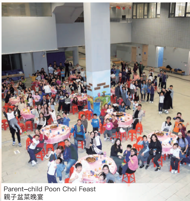
Parent-child Poon Choi Feast 親子盆菜晚宴