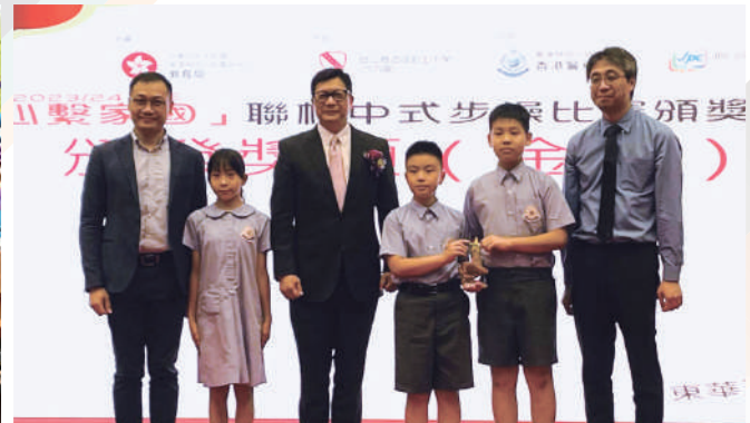
Inter-school Chinese Style Drill Flag-raising Competition — Gold Award 聯校中式步操比賽 —— 金獎