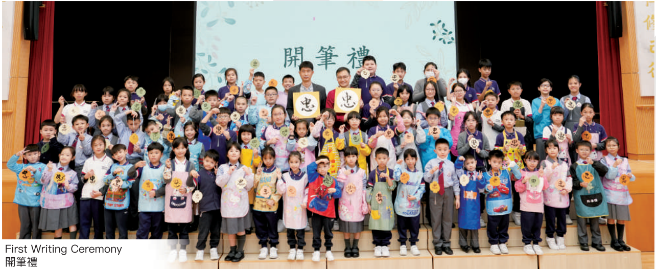
First Writing Ceremony 開筆禮