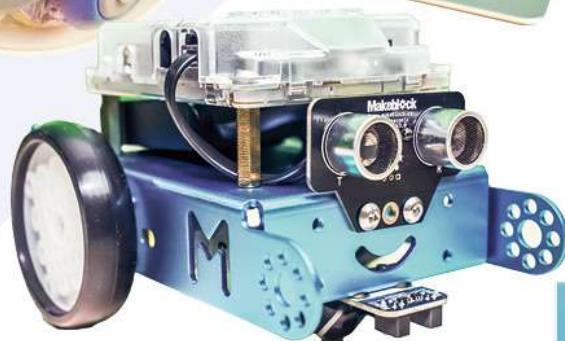
IT Equipment IT 設備