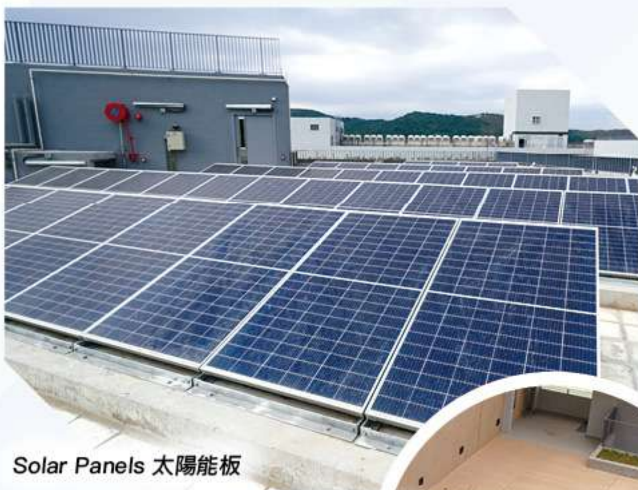
Solar Panels 太陽能板