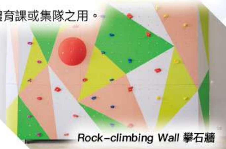
Rock-climbing Wall 攀石牆

位於地下，可作簡易運動場地供學生體能發展及運動，並作低年級學生上體育課或集隊之用。