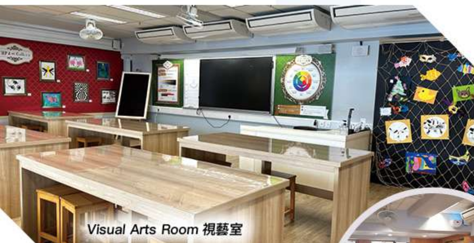
Visual Arts Room 視藝室