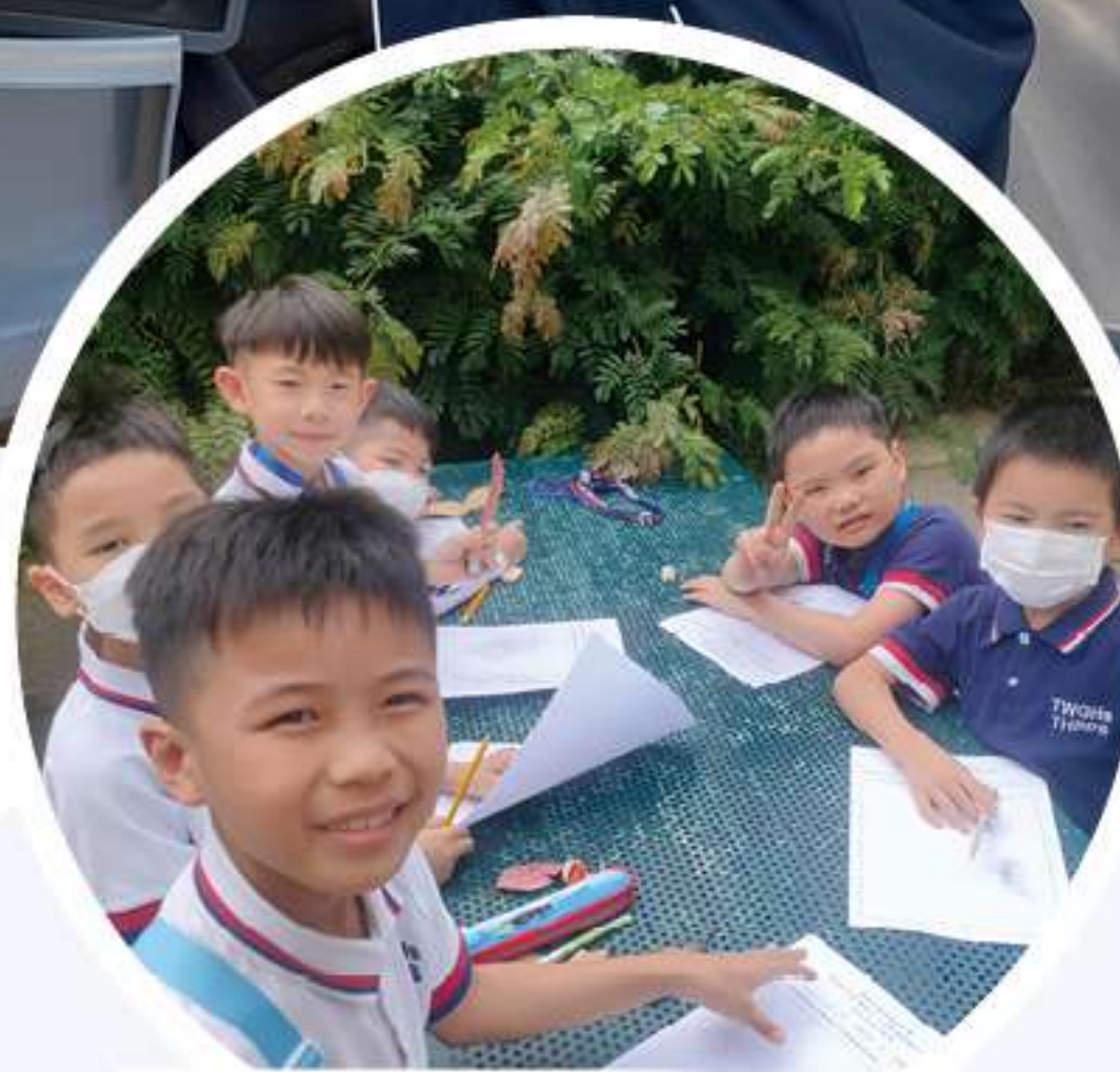
Discovery Learning 遊歷課

Throughout the process of participating in the experiential learning programmes, students are encouraged to plan their own itineraries and take the initiative to explore more about the destinations. By observing and doing different tasks during the journey, it is hoped that new