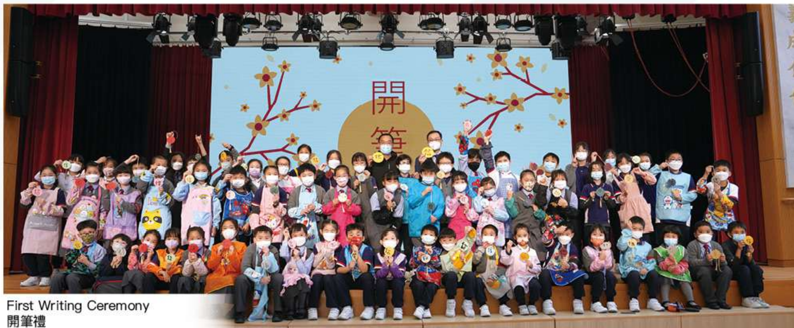
First Writing Ceremony 開筆禮