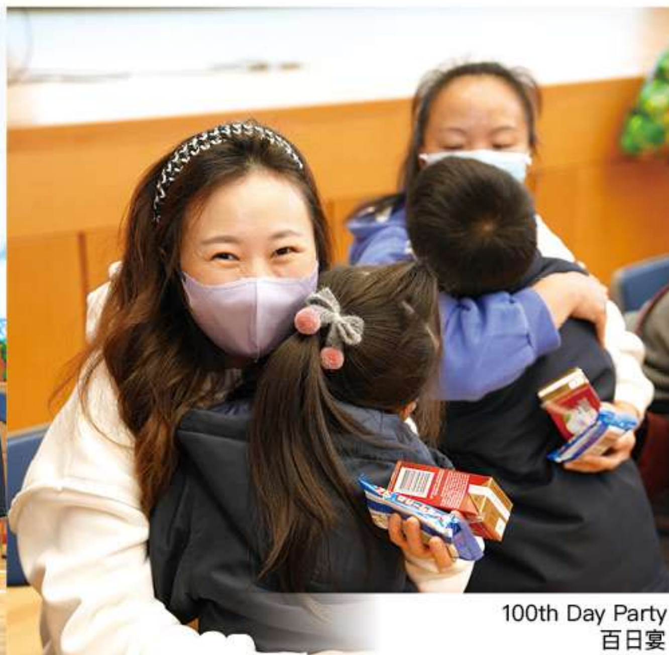
100th Day Party 百日宴