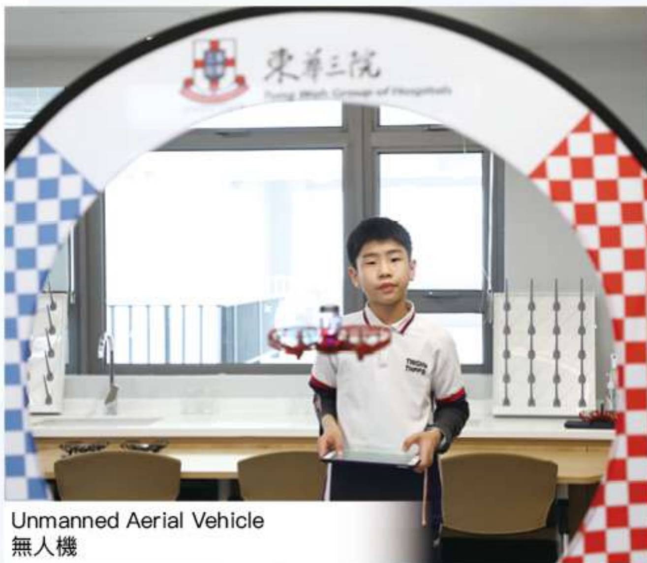
Unmanned Aerial Vehicle 無人機