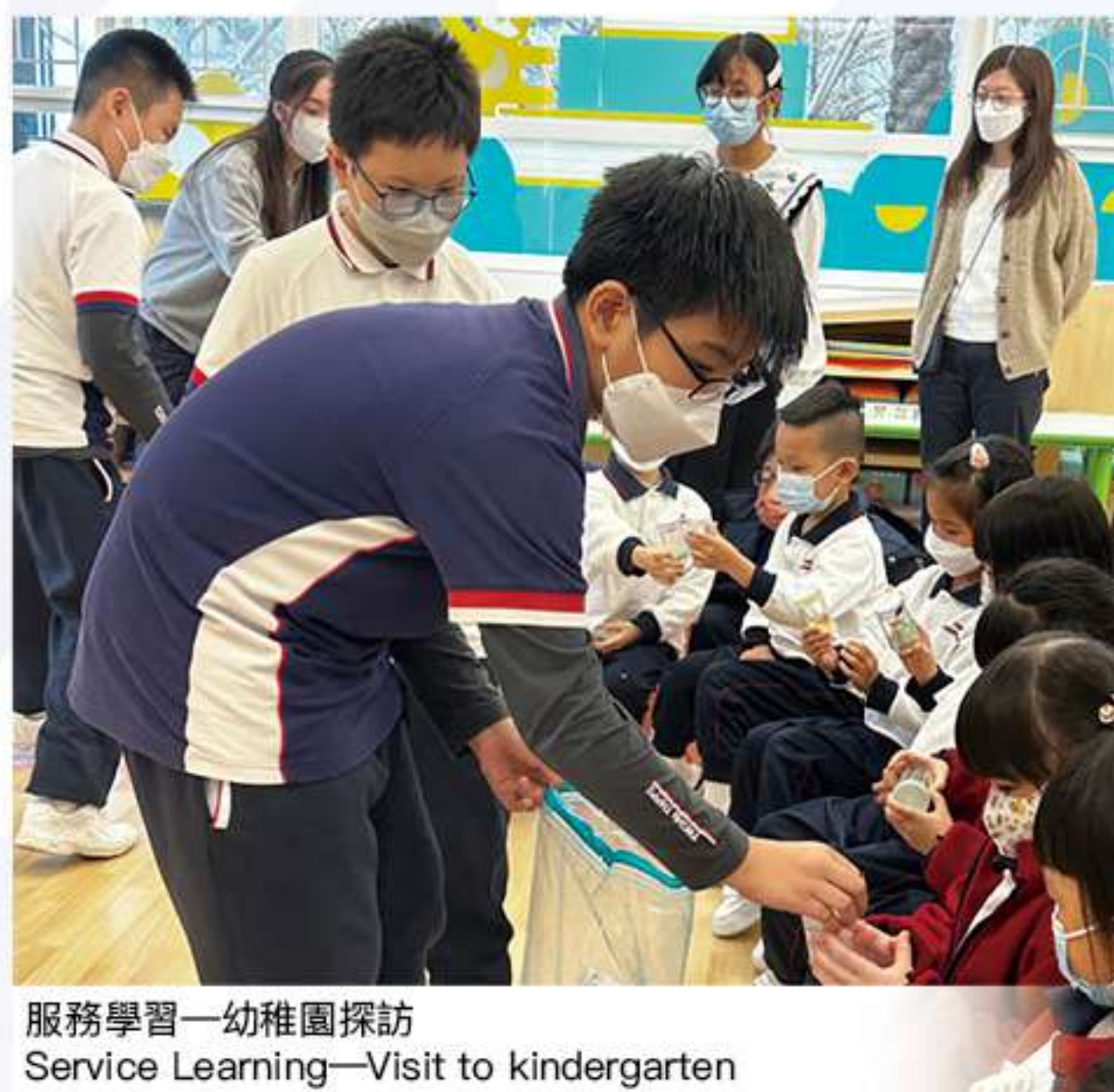
服務學習—幼稚園探訪 Service Learning—Visit to kindergarten