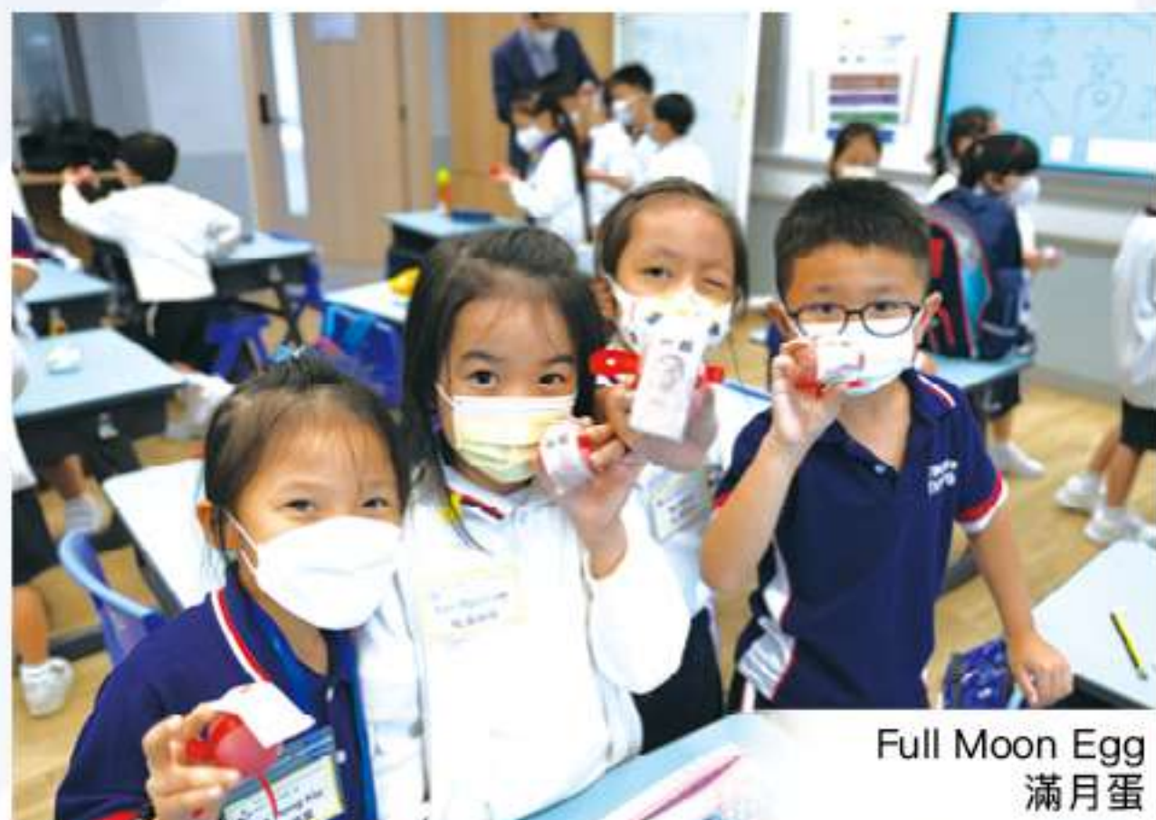
Full Moon Egg 滿月蛋

To cultivate students' virtues with positive values, we strive to promote the TWGHs Moral Education Curriculum and Positive Education in the school. In addition, the school will provide students with a wide range of service-learning activities, such as "Tung Wah Cultural Inheritor programme", "Soccer Ambassador" programme, etc., which provide an opportunity for students to contribute to the society.