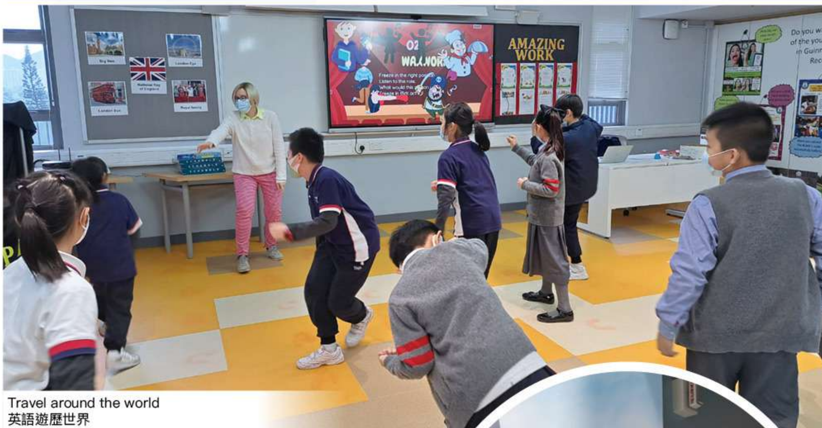
Travel around the world 英語遊歷世界