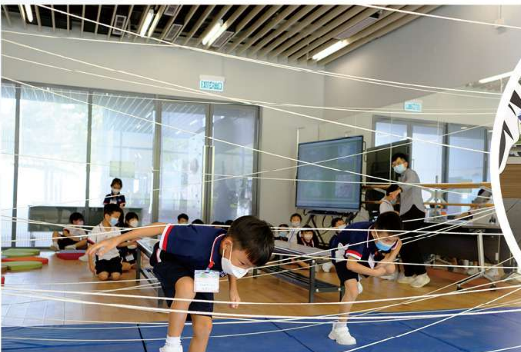
Mathematics Performance Assessment 數學實作評估

我們透過體驗式遊歷課程，鼓勵學生親自規劃行程、主動探索和學習遊學活動目的地的知識，讓他們能夠從遊歷中觀察、體驗和學習新知識和技能。此外，透過境外學習交流活動，孩子們能夠與世界各地的學生互相交流和了解，體驗不同風俗文化和生活，從而放眼世界，擴闊視野。