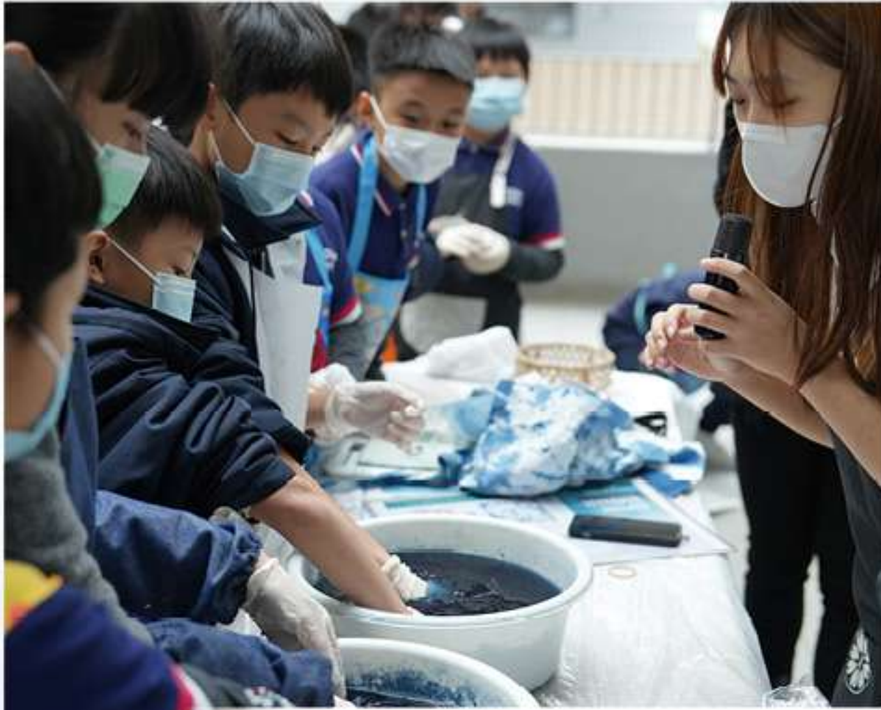
Hakka Indigo Dyeing Workshop 客家藍染工作坊