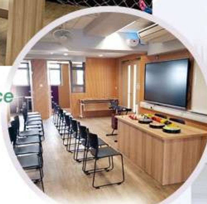
Music Room 音樂室

位於六樓的環球探索中心，以探索世界為主題，讓學生認識地理位置、座標方向及空間概念等。